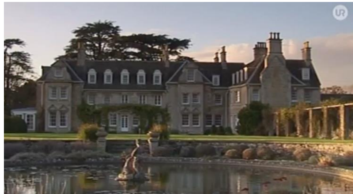
skærbilledet er fra SVT2-2012

Denne pædagogiske vejledning indeholder ideer til arbejdet med tema og indhold før, under og efter udsendelsen. Vejledningen fokuserer på forskellen mellem skolen i Danmark og England samt forskellen mellem det private og offentlige system.