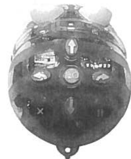
USB Charging Socket